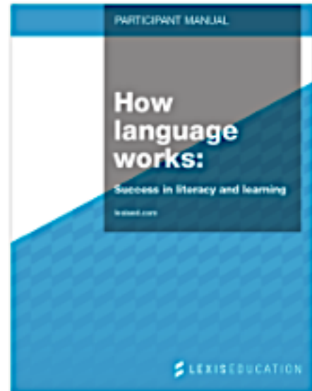
How language works: Success in literacy and learning