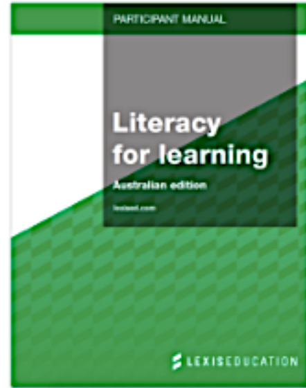
Literacy for learning: Australian Edition